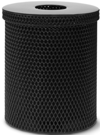
top not included

211 North Lindbergh Blvd. St. Louis, MO 63141 888.535.5005 tel 314.754.0835 fax specify@anovafurnishings.com anovafurnishings.com