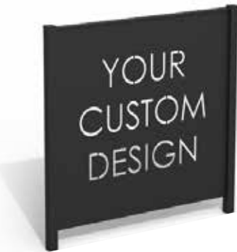
Custom Privacy Panel — Shown in textured black.