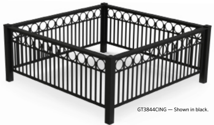
GT3844CING — Shown in black.

Configure your fencing to suit your space.